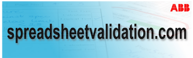
ABB DaCS™ Experience

Web: http://www.spreadsheetvalidation.com http://www.abb.com/consulting