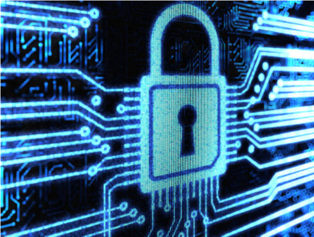
ABB Engineering Services Byland Way, Belasis Hall Technology Park Billingham, TS23 4EB, United Kingdom