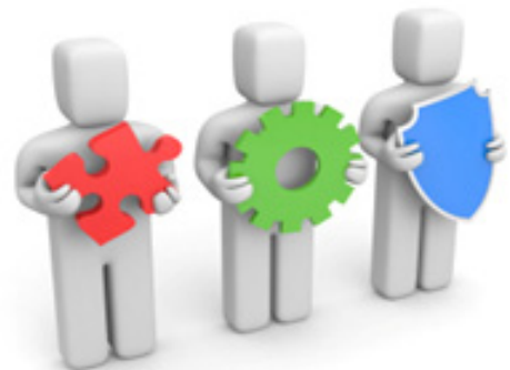
ABB Engineering Services is the global leader in spreadsheet validation services for the Life Sciences and regulated industries. ABB operate in over 100 countries worldwide and employs 103,000 people serving customers in the chemicals, consumer, life sciences, manufacturing, metals, paper, petroleum and utility industries.

ABB provide a full range of consultancy services for DaCS™, including maintenance, installations, spreadsheet development and testing services.