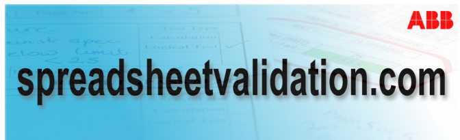
ABB Validation Experience

Web: http://www.spreadsheetvalidation.com http://www.abb.com/consulting