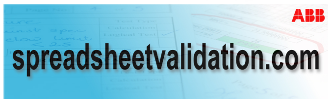
ABB Engineering Services is the global leader in spreadsheet validation services for the Life Sciences and regulated industries. ABB operate in over 100 countries worldwide and employs 103,000 people serving customers in the chemicals, consumer, life sciences, manufacturing, metals, paper, petroleum and utility industries.